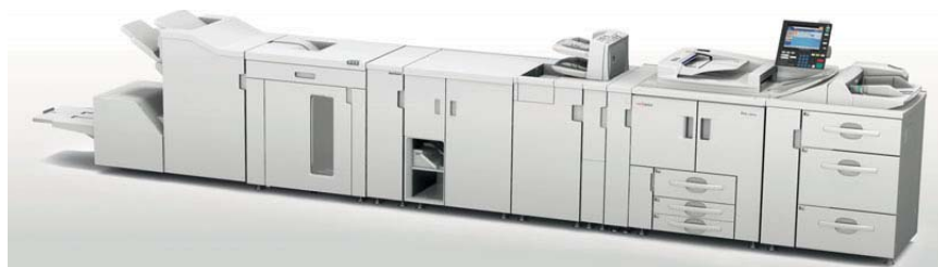
InfoPrint Pro 1357EX featuring high-capacity input, high-capacity stacking and booklet capabilities

Move up to a solution that can fulfill your customers' expectations.