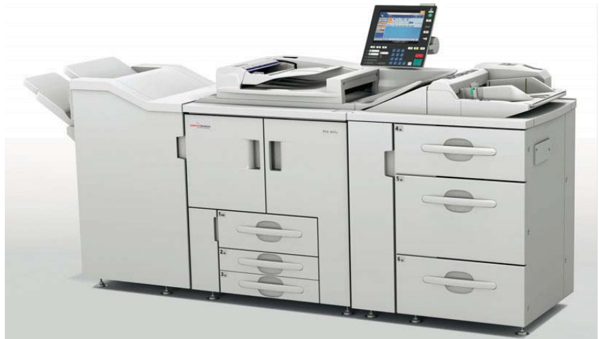
InfoPrint Pro 907EX featuring 7 input sources and booklet finishing capabilities