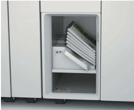
Fully-automated ring binding