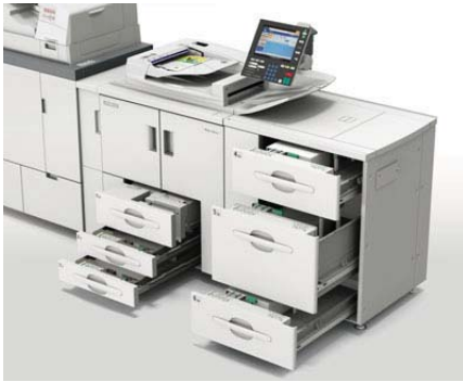
Up to 6,500 sheets of ledger/A3 input